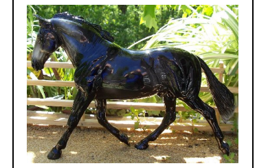
9. Collected Canter Left 10. Half Pass at Trot, Right 11. Medium Trot 12. Lengthen Stride Trot 9. and 10. Intermediate I or II/Grand Prix 2nd to 4th Level First Level