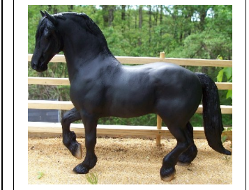
5. Passage 6. Half Pass Right 7. Piaffe 8. Collected Trot 5./6. and 7. Intermediate I or II/Grand Prix First or Second Level