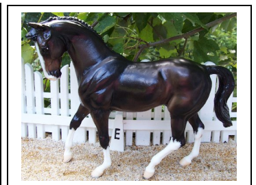
1. Canter Pirouette Left 2. Medium Canter Right, 1. Intermediate I or II/Grand Prix 2./3. and 4. Third/Fourth, Prix St. Georges Intermediate I or II/Grand Prix